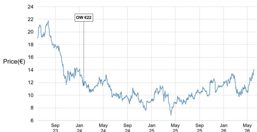
Valeo SA (VLOF.PA, FR FP) Price Chart

Company-Specific Disclosures: J.P. Morgan does and seeks to do business with companies covered in its research reports. As a result, investors should be aware that the firm may have a conflict of interest that could affect the objectivity of this report. Investors should consider this report as only a single factor in making their investment decision. Important disclosures, including price charts and credit opinion history tables (if applicable), are available for compendium reports and all J.P. Morgan–covered companies, and certain non-covered companies, by visiting https://www.jpmm.com/research/disclosures , calling 1-800-477-0406, or e-mailing research.disclosure.inquiries@jpmorgan.com with your request.